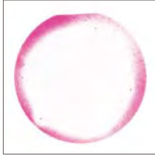
Pressure is uneven